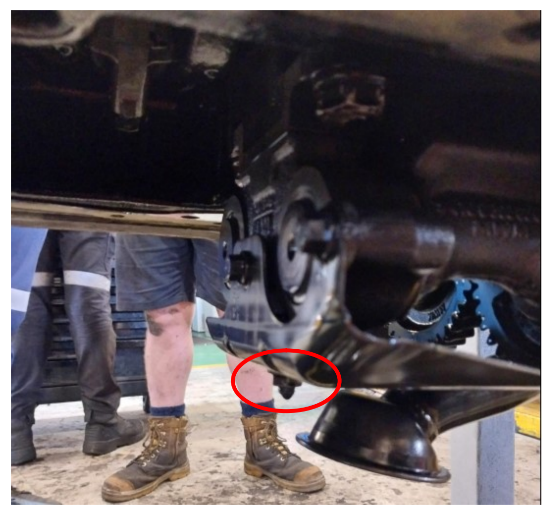
Figure 3: Deflector design 2 as installed with sump removed. Note protruding vertical fastener.